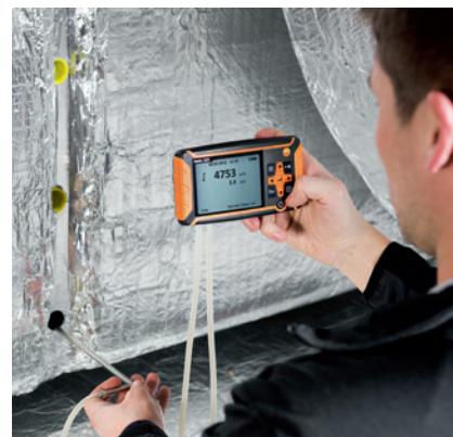
Pitot tube measurement in a duct